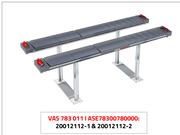
VAS 783 011 | ASE78300780000: 20012112-1 & 20012112-2

Elektro-hydraulic 4-ram lift, 5.5 t, with platforms