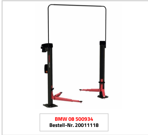
BMW 08 500934 Bestell-Nr. 20011118

Electro-mechanical 2-post lift, 3.2 t capacity