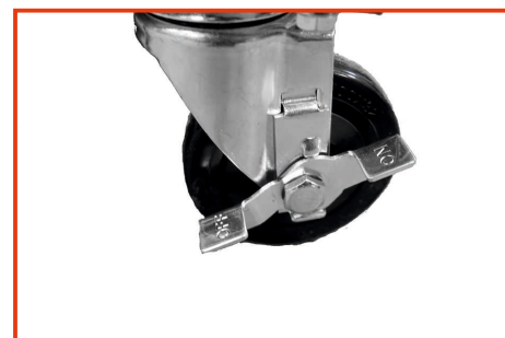
CABINET EQUIPPED WITH WHEELS WITH A BRAKE