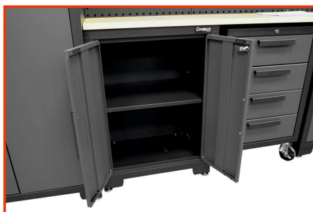
LOWER CABINET WITH SHELF