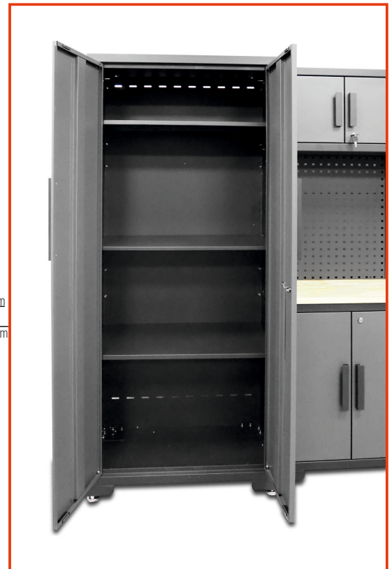
CAPACITY CABINET WORKSHOP 3 HEIGHT ADJUSTABLE SHELVES