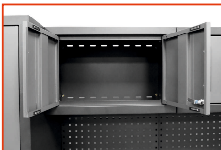
UPPER CABINETS WITH A CAPACITY OF 68 KG