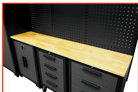
WORKTOP 180 CM LONG