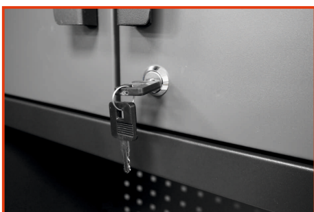
ALL LOCKABLE CABINET