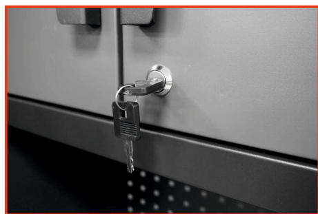
ALL LOCKABLE CABINET