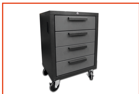
CABINET WITH DRAWERS ON WHEELS