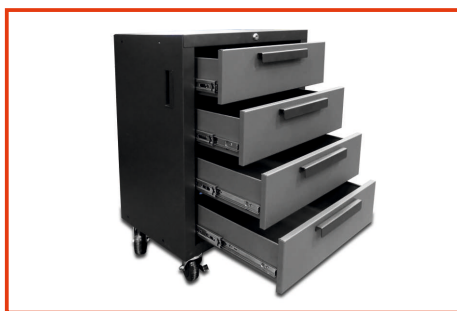
DRAWERS WITH A CAPACITY OF 45 KG