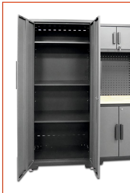
CAPACITY CABINET WORKSHOP 3 HEIGHT ADJUSTABLE SHELVES