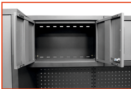
UPPER CABINETS WITH A CAPACITY OF 68 KG